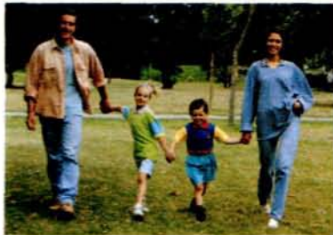
They are walking in the park now.