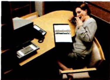
She is working hard these days. (Не в данный момент. Сейчас она зевает.)